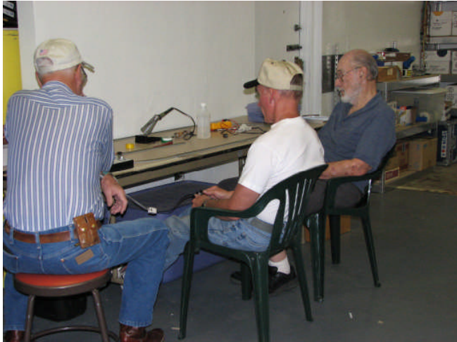
Meeting of the minds?

Open House July 7th. New Mexico State Fair Sept 13-18, 2007